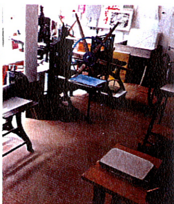
Dartington Print Workshop on the move